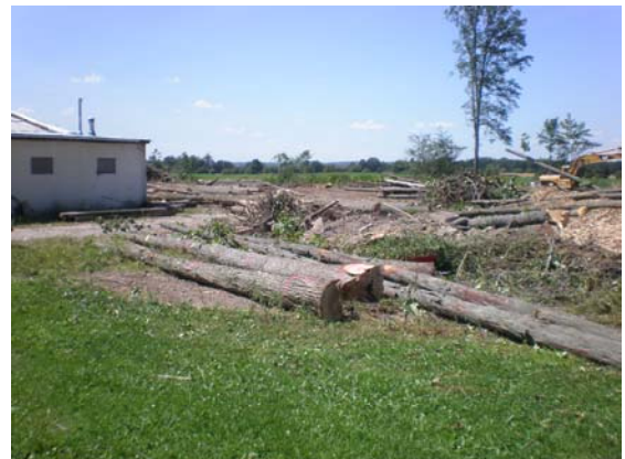
CLEARING WORK BEHIND THE PAINTSHOP

This cost is a direct flow through and does not address the bigger issue of the entire East side electrical upgrade which we are now working on.