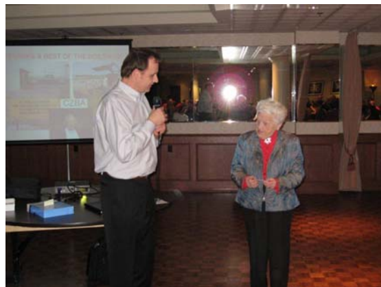
COPA 28 HONOURS THE MAYOR!