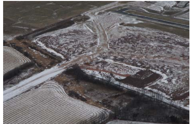
BIRDS-EYE VIEW OF WESTSIDE WORK

Winter can be the best time to fly and we want to make sure that your aircraft is not damaged by a forbidden corrosive material at the airport.