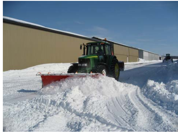
WINTER IS UPON US

"See and be Seen" needs to apply to ground taxiing as well as in the air!