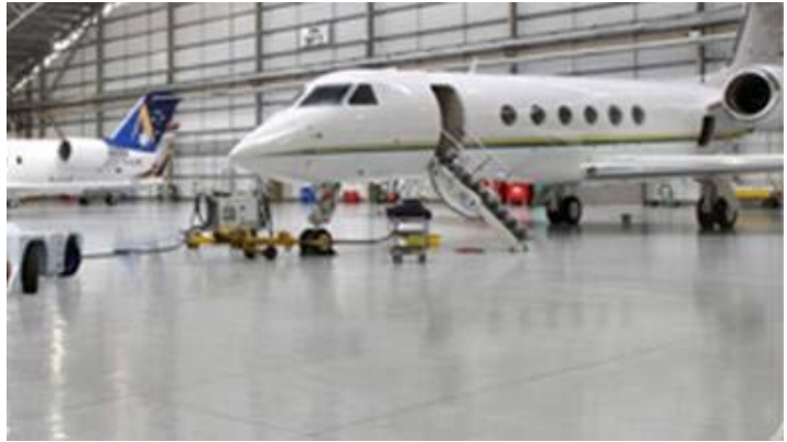
NOW THAT'S A HANGAR!