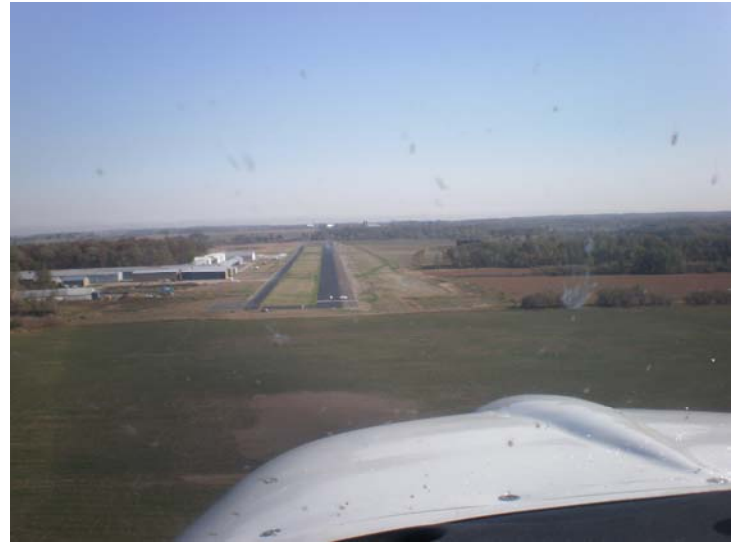
Final to the new wider RWY